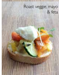
Roast veggie, mayo & feta