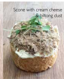
Scone with cream cheese & biltong dust