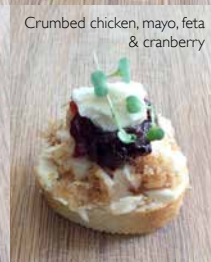
Crumbed chicken, mayo, feta & cranberry