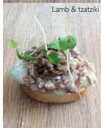
Lamb & tzatziki