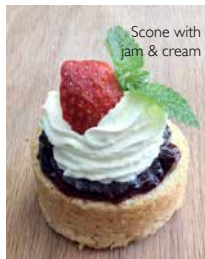
Scone with jam & cream