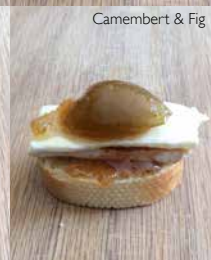
Camembert & Fig