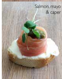
Salmon, mayo & caper